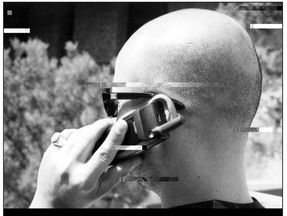
Mobile phones—new research being watched closely by governments, health groups and the telecommunications industry.