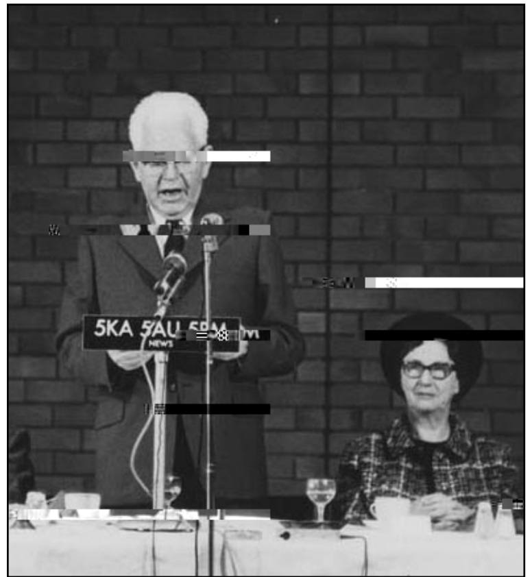
Then Governor of South Australia, Sir Mark Oliphant and Dame Roma Mitchell, then Deputy Chancellor of the University of Adelaide, at the official launching of Radio 5UV in 1972.