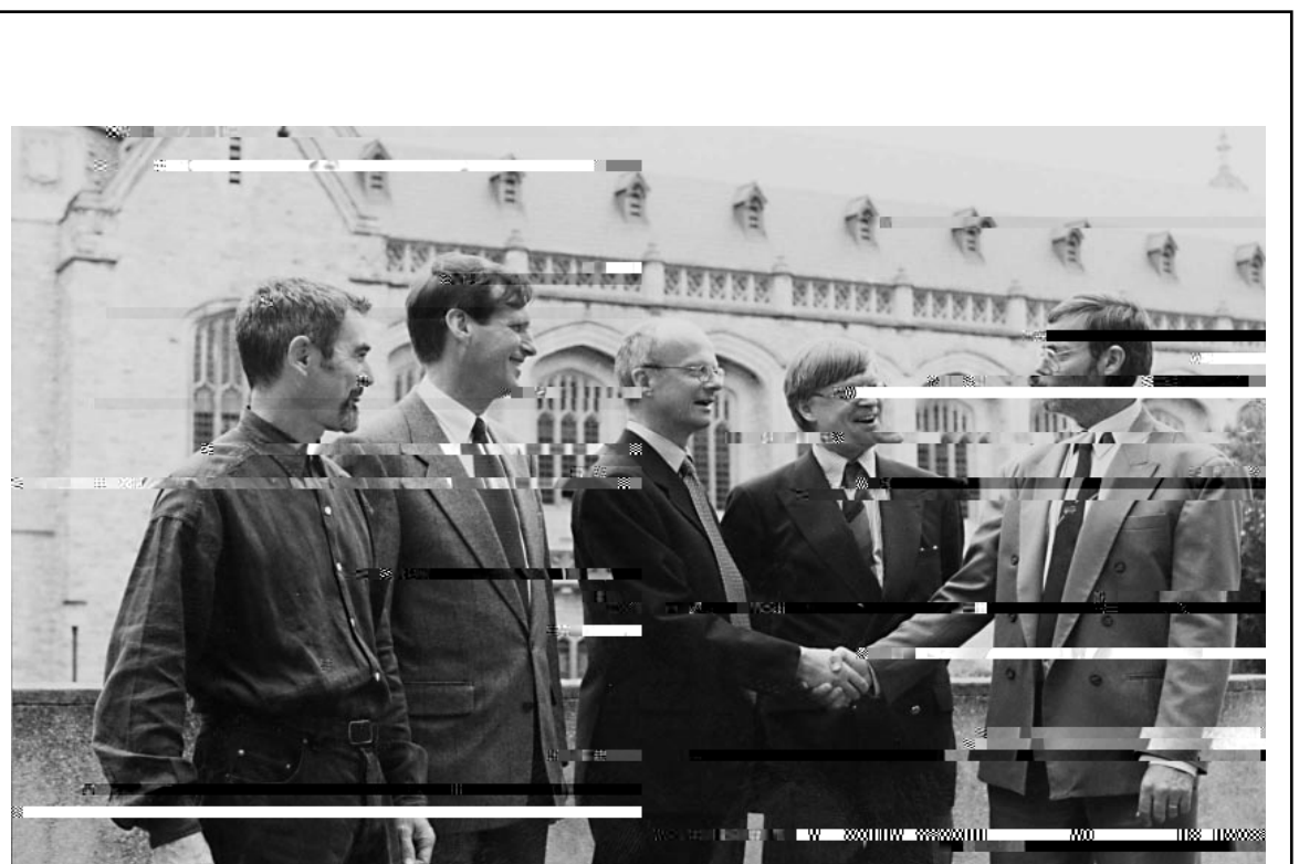
The Faculties of Law at the University of Adelaide and University of Mannheim, Germany, have officially launched an exchange agreement for closer collaboration. Under the agreement students can exchange between Adelaide and Mannheim, giving them the chance to expand their

As the understanding of this fact becomes more widespread, and resources are earmarked to support and spread such programs, the process of internationalisation will become ever more rewarding for staff and students of the University of Adelaide.