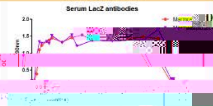
Fig. 5. Circulating antibodies to LacZ

CONCLUSION: A single LV vector airway administration can introduce a transgene into a primate lung that persists for at least 14 months. The presence of vector genes in liver and spleen indicate that long term gene distribution occurs outside the lung. The presence of circulating antibodies to the transgene for 12 months may be due to long term transgene expression or an exposure to the transgene.