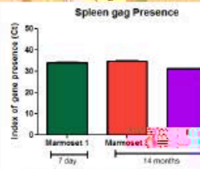
Fig. 4c. Gag presence in frozen spleen samples= 2-3 replicates