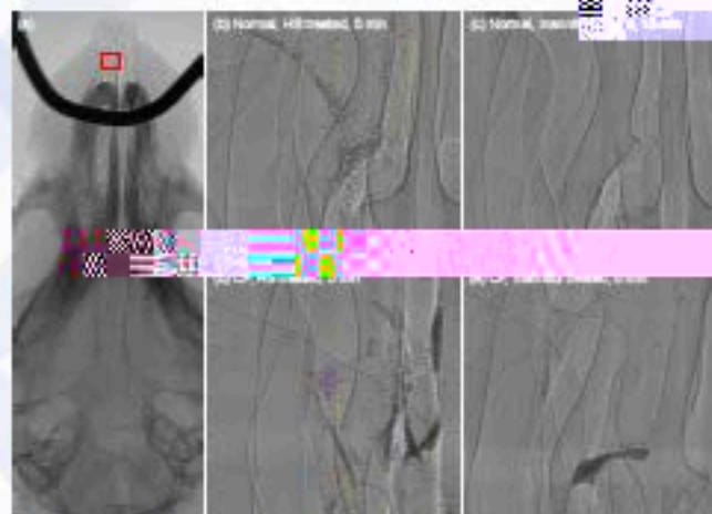
(F1) (a) image of the mouse skull showing the region of interest marked with a red box. (b-e) Example high magnification images of HRI glass beads in the nose of four live mice. Moving particles are identified with a red cross with locations in subsequent images like circles. Stationary particles are not marked. The image shows a rapidly moving outer bead.

-Seven mice (n=2 normal, n=5 CF) were excluded due to the presence of too many particles to enable accurate HRI bead tracking.